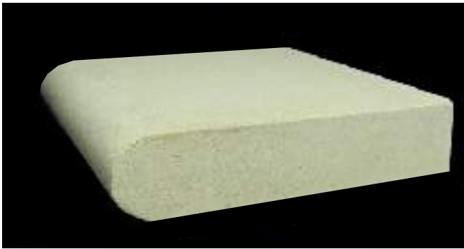
Straight (S) **Pieces are 12" in Length