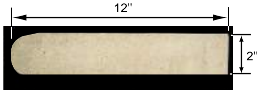
Side View ST-200-12