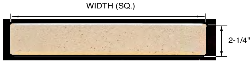
PC-104 Side View